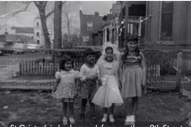
St Cajetan's in background, from south on 9th Street

The Peace and Healing Garden will begin to restore an understanding for what this place meant to so many who occupied it before.